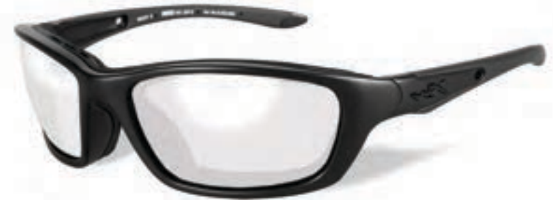
Facial Cavity Seal