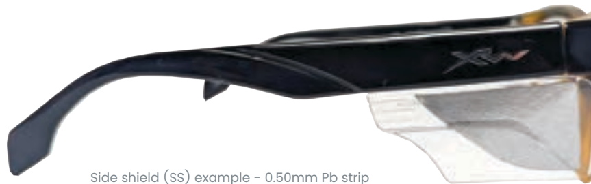
Side shield (SS) example - 0.50mm Pb strip