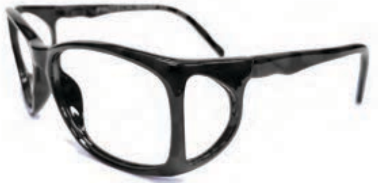
Fig A - Side shield example - 0.75mm Pb Glass

Many of our frames come with side shields for maximum protection. There are three types of side shields – glass lenses, side shield attachments (SSA) and vinyl strips added to existing side shield areas (SS). For all side shield types, the standard protection is 0.50mm Pb. Some frames are able to accommodate a 0.75mm Pb glass, such as the 53 Wrap shown here (Fig A.).