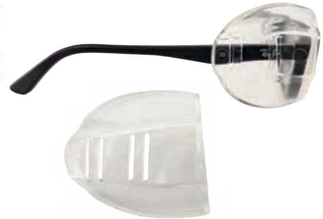
Side shield Attachment (SSA) example