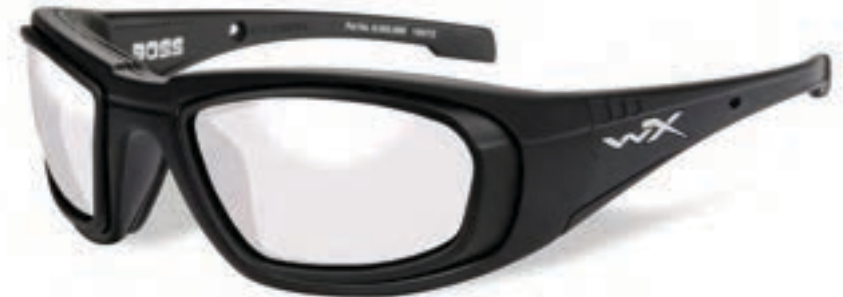
Facial Cavity Seal